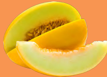
YELLOW HONEYDEW MELON

HARVESTING WILL START AROUND MID-JUNE. WATCH THIS SPACE!