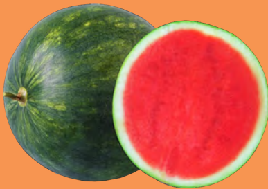
MINI SEEDLESS WATERMELON